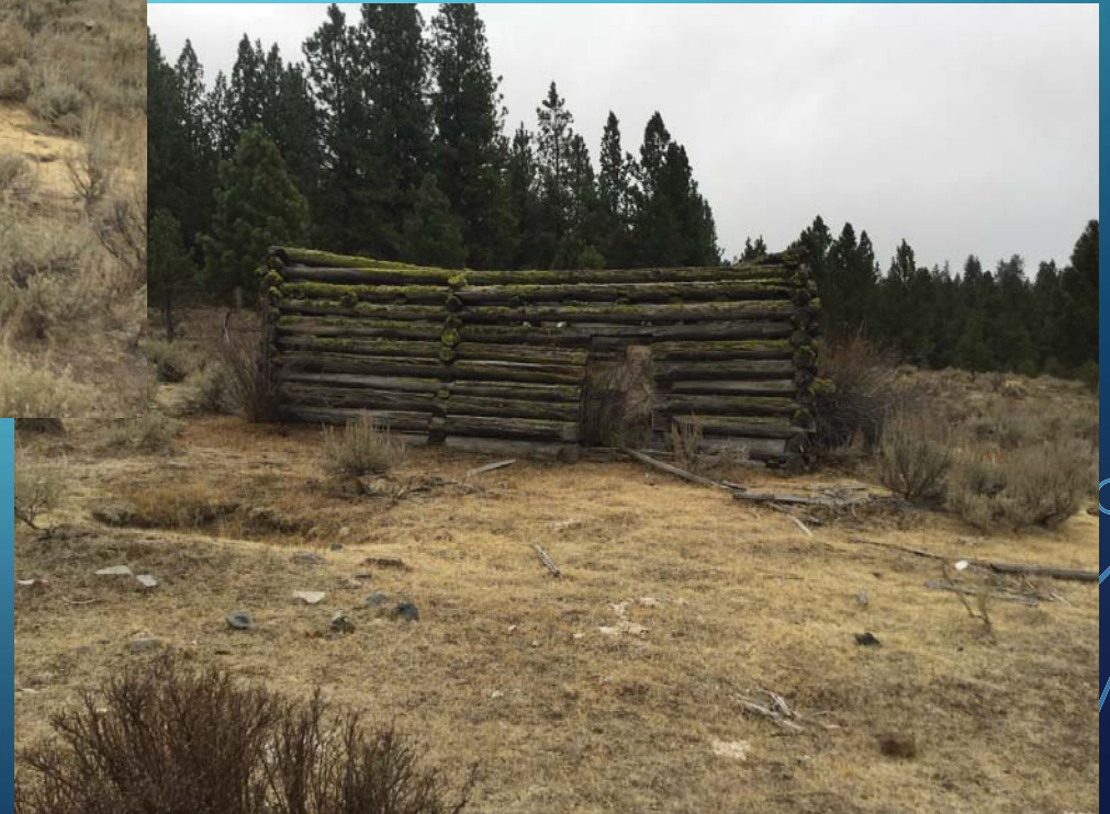
Historic Cabin Post burn