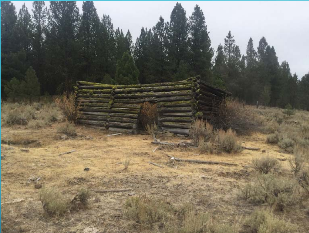
Historic Cabin Pre burn